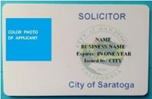
Solicitor Permit Sample ID